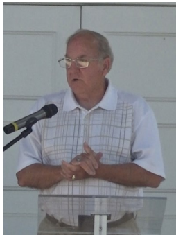
Lee Church - Churches